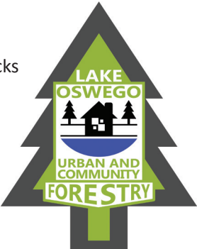
2018 Photo Contest.