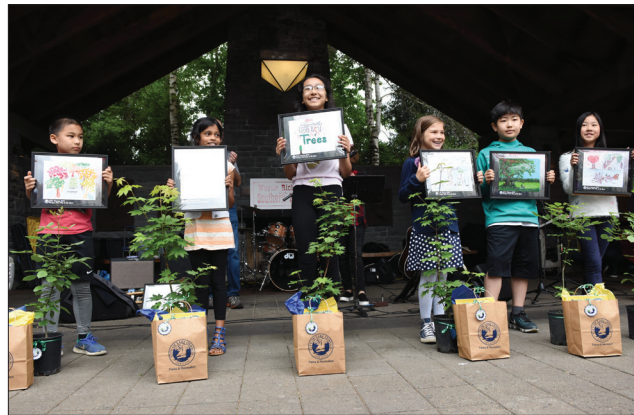
Photo: 2018 contest winners.

Join us to celebrate forestry at the Farmers' Market on opening day! Activities include